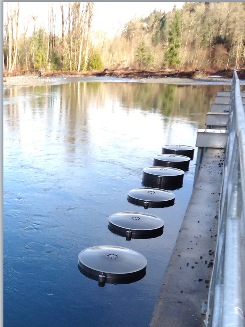
Elwha Surface Water Intake Screens

rally occurring or result from urban storm water runoff, industrial, or domestic wastewater discharges, oil and gas production, mining or farming;